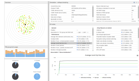
Figure 2: 802.11ah simulation visualizer

stations while the simulation is running. This greatly speeds up the detection of problems in simulations and we can quickly determine if the parameters of the simulation are relevant. It is implemented as a NodeJS web-server which (i) hosts the simulation data sent by ns-3 through TCP connections each second of the simulation time and (ii) forwards the data to the web-browser clients through a websocket in case of live data. The visualizer is shown in Figure 2 and depicts the network topology, RAW slot usage, as well as multiple other metrics for near real-time tracking shown in the tables. Green (good) and red (bad) color gradations in the network topology map depict the behavior of the node in the context of the selected metric.